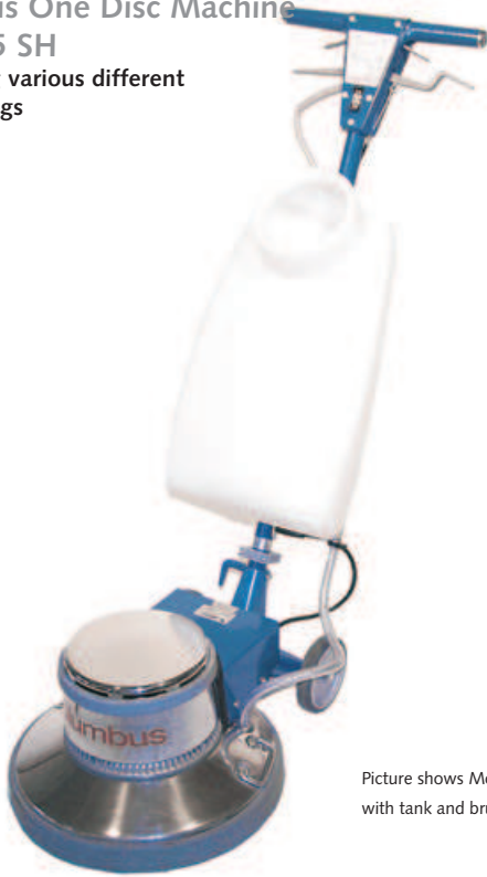
Picture shows Mod.135 SH with tank and brush

Columbus One Disc Machine Mod.135 SH For cleaning various different floorcoverings